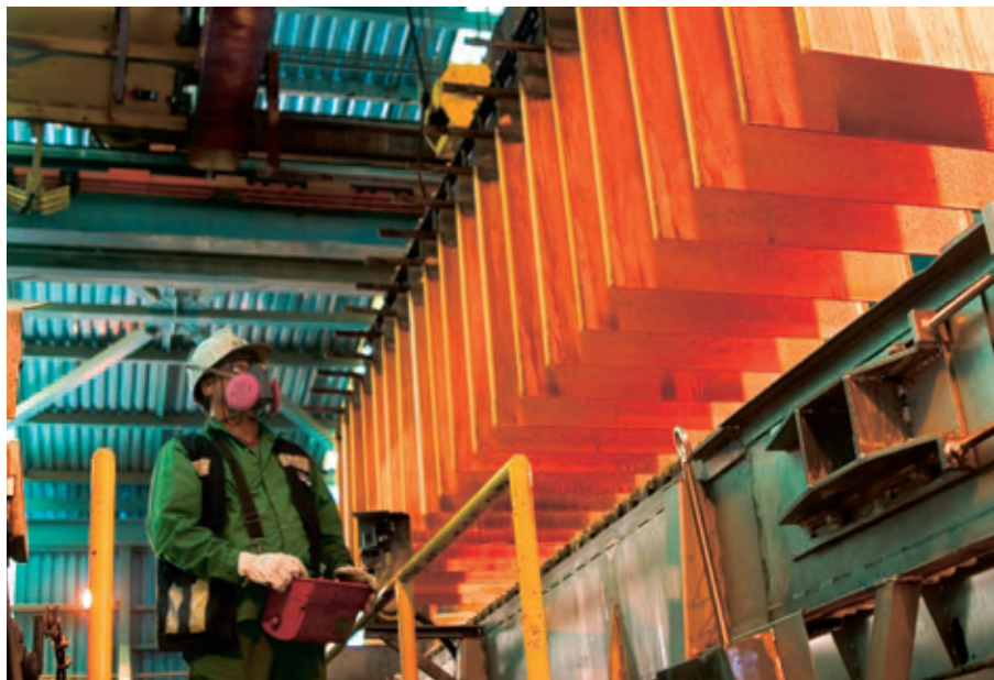
Above: Washing down copper cathodes in the solvent-extraction/electro-winning plant at Mantos Blancos in Chile

In July 2007, Anglo American became a 50% partner with the Northern Dynasty Partnership (a wholly owned affiliate of